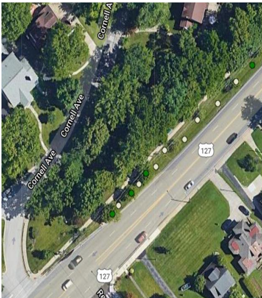
Work Area 7. – Superior to Cornell. Approximate planting location for six (6) trees to fill in gaps of existing plantings.