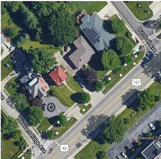
Work Area 6. – Burdsall to Pleasant Ridge. Approximate removal locations for seven (7) existing trees and replacement planting of eight (8) trees.